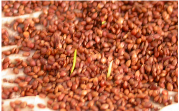
Figure 2. Centipedegrass chlorophyll deficient mutant

Putative drought tolerant mutants were recovered after 60:2:70 (dry:wet:dry) day trials in bermudagrass (15 individuals), buffalograss (11 individuals), and blue grama (6 individuals). Indicative phenotypes are shown in Figure 3 below.