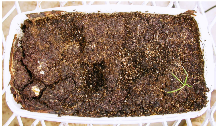
Figure 1. Example exposure series demonstrating maximum effective mortality ( 1 \times 10^3 ).

Synergistic mutagenesis treatments have been completed for 5 \times 10^6 bermudagrass seed, 1 \times 10^6 buffalograss seed, 1 \times 10^6 blue grama seed, 1 \times 10^6 zoysiagrass seed, and 2 \times 10^6 centipedegrass seed. Leaf pigment mutants remained rare events, with only a single variegated centipedegrass mutant being recently identified (Figure 2).