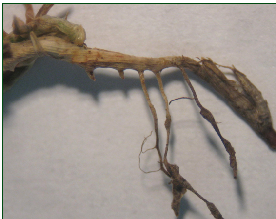
FIGURE 3. Root-knot nematode galls on bermudagrass roots.

It is difficult to diagnose nematodes in turfgrasses because the symptoms are similar to drought stress, nutrient deficiency and fungal root diseases (Figure 2A and 2B). During the growing season, daytime heat may wilt the grass or turn it yellow when damaged root systems cannot supply adequate nutrients and water to the plant. The turf can become thin and weeds often encroach in affected areas. Grass roots