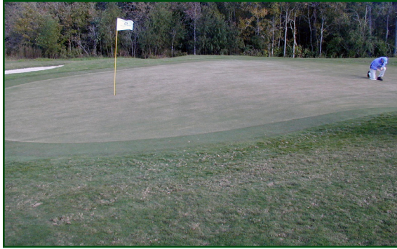
FIGURE 2A and 2B. Nematode damage on bermudagrass putting green.