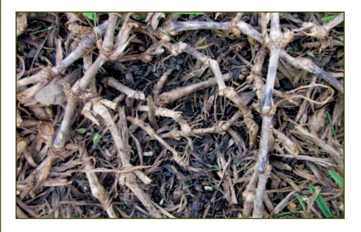
Figure 3. Dead roots and stolons of St. Augustinegrass.