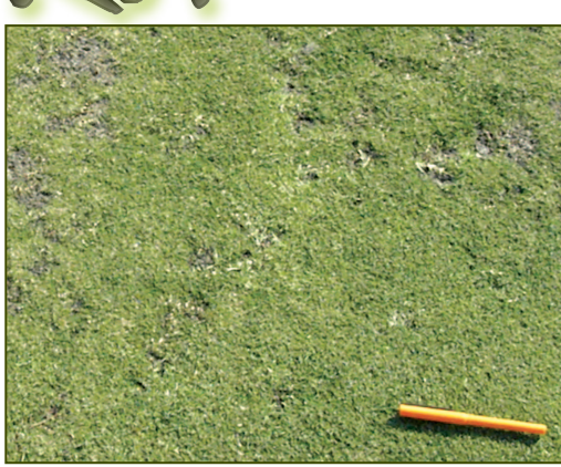
Figure 2. Bermudagrass infected with takeall root rot.