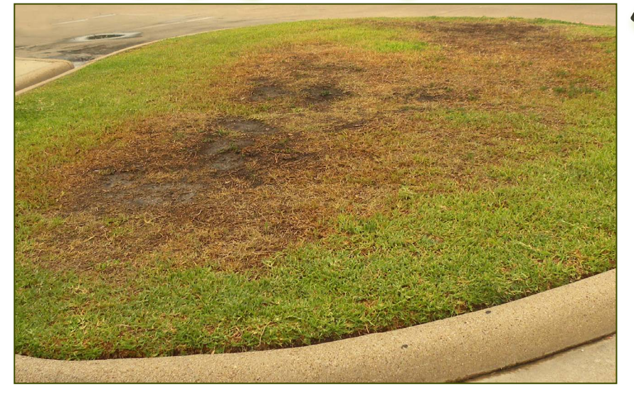
Figure 1. Large, irregular patches of take-all root rot on St. Augustinegrass.