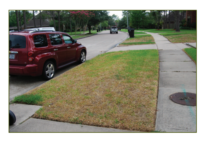
Figure 5. Chinch bug damage on a St. Augustinegrass lawn.