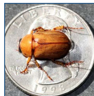
Figure 3. Southern masked chafer ( Cyclocephala lurida ) adult beetle.