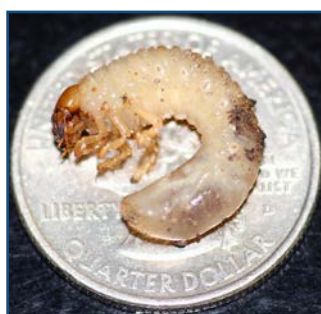
Figure 1. May/June beetle 3rd instar white grub.

W hite grubs (Fig. 1) are the larval stage of scarab beetles, also known as May/June beetles or chafers. There are over 100 species of May/June beetles in Texas, but only a few species cause damage to turfgrass. Those species include May/June beetles, Phyllophaga crinita and Phyllophaga congrua , as well as the southern masked chafer, Cyclocephala lurida (Figs. 2 and 3). White grubs feed on the roots and other belowground portions of warm-season turfgrasses, such as bermudagrass, zoysiagrass, buffalograss, and St. Augustinegrass. They also feed on cool-season turfgrasses such as fescues, bluegrasses, and ryegrasses. Visible damage includes irregularly shaped patches of dead turfgrass that may resemble symptoms of drought stress. In severe cases, damaged turfgrass can often be rolled up like a carpet (Fig. 4). Secondary damage may also occur when skunks, raccoons, and armadillos dig through the turfgrass in search of grubs to eat. Such damage may be particularly severe on golf courses, home