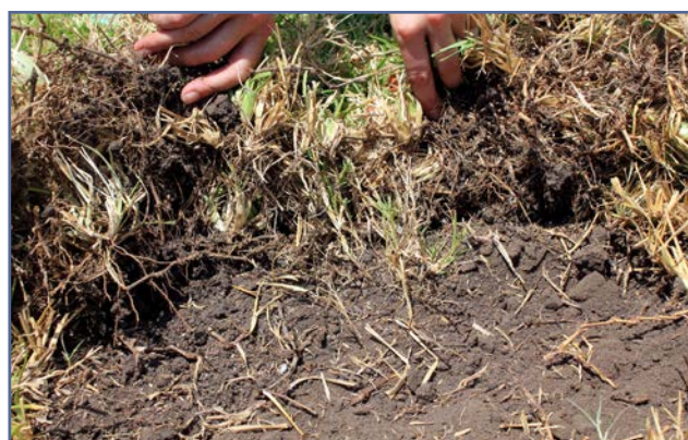
Figure 4. White grub damage to turfgrass roots.

lawns, or athletic facilities adjacent to wooded areas. As with many insect pests, prevention is a critical component of effective white grub management.