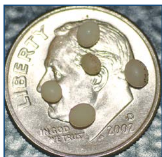
Figure 5. May/June beetle eggs.

It's important to note that between March and June several other species of scarab beetles may also emerge in large numbers and be attracted to windows and lights. Although related to the June beetle, these early-emerging beetles do not damage turfgrass, though a few may temporarily defoliate trees and other plants. No treatments should be needed for these beetles.