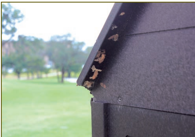
Figure 5. Fall armyworm eggs laid on a golf course water cooler.

Damage by fall armyworm caterpillars (larvae) initially appears at the tips of the grass blades. The tips look transparent due to the plant cells being eaten. If left uncontrolled, caterpillars may continue feeding, stripping tissue from turfgrass leaves, and leaving brown areas adjacent to green turf.