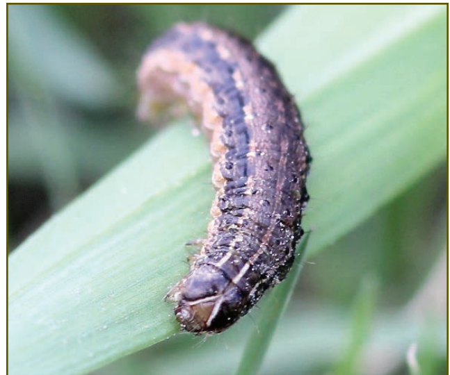
Figure 6. Inverted “Y” on head of a fall armyworm.

sixth larval stages eat over 90 percent of the total foliage the armyworm will consume over its life span. This usually means that early damage is often overlooked, and most defoliation takes place over a relatively short period during the later development stages. Caterpillars feed throughout the day but are typically most active early in the morning and late in the evening. They can often be observed easily at these times.