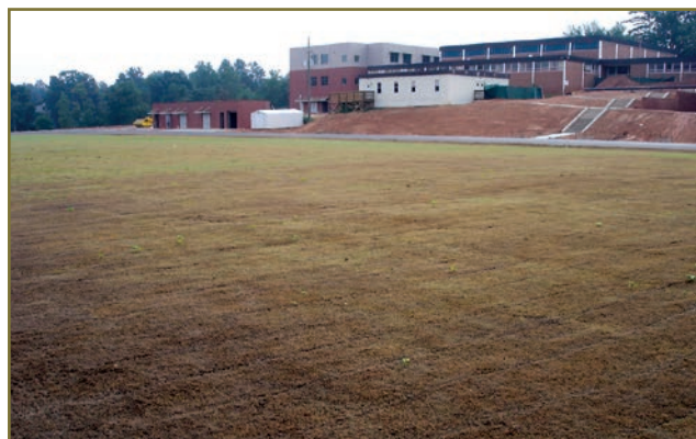
Figure 2. Fall armyworm damage to a football field. on golf courses, athletic fields, and home landscapes. The fall armyworm has four life stages: egg, larva, pupa, and adult. Adult moths (Fig. 3) are generally gray, with a 1½-inch wingspan and