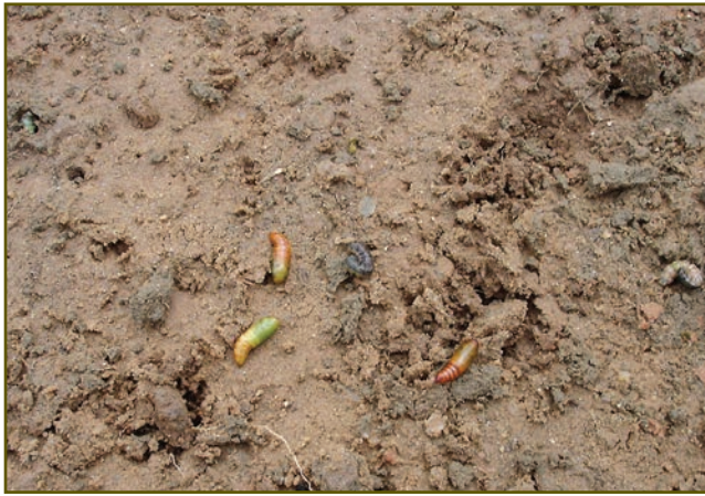
Figure 7. Fall armyworm pupae.

Initial damage can resemble drought stress but will progress to complete loss of foliage if there are enough armyworms and the turfgrass is left untreated. There may also be a distinct line between damaged and undamaged areas. Healthy bermudagrass typically recovers after defoliation because its rhizomes and stolons grow so aggressively. However, newly established bunch-