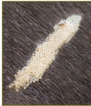
Figure 4. Fall armyworm eggs.

After hatching, newly emerged larvae may spin a silken thread to lower themselves to the turf to feed. The earliest instars, one to four, eat relatively little leaf material, while the fifth and