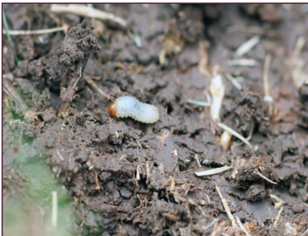
Figure 5. Hunting billbug larvae.

Hunting billbug biology and life cycle timing are poorly understood for the various regions of Texas. Billbugs most often overwinter in the adult stage but can also overwinter as large larvae. As soil temperatures increase in the spring, adults