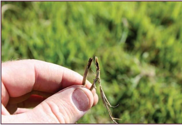
Figure 3. Hollow stems, a symptom of billbug injury.