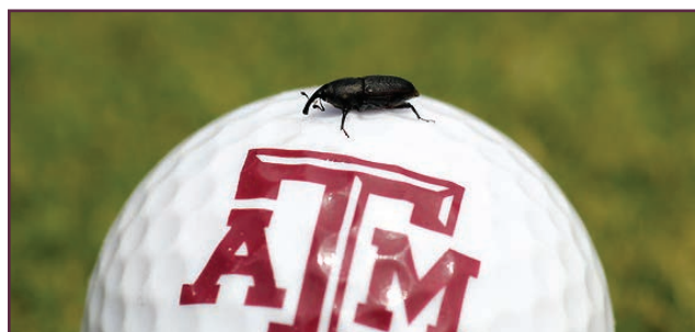
Figure 1. Adult hunting billbug.

H unting billbugs (Fig. 1) are an occasional turfgrass pest in Texas, though their presence and impact appear to be increasing. The grasses they damage most often include bermudagrass and zoysiagrass turf, but they have also been known to feed on St. Augustinegrass and Centipedegrass. Damage typically appears as irregular, elongated, or round areas of brown and dying grass. These patches can often be misidentified as delayed spring green-up, disease, or as insufficient water or nutrients. Damage can occur at any time during the spring, summer, or early fall but typically occurs in the spring and fall when adults use chewing mouthparts (Fig. 2) to feed on the stems of the turfgrass plant. Female adults also cause damage by laying their eggs into turfgrass stems and leaf sheaths during spring and fall. Damage that occurs in the summer is typically associated with larvae feeding on the turfgrass roots and initially appears as small pockets of yellowing and dying grass that may grow larger and coalesce as the larvae continue to feed. Damage symptoms include hollowed out stems (Fig. 3) as well as turfgrass leaves and sheaths that separate easily from the crown when pulled apart. Zoysia matrella cultivars appear to be more resistant to the hunting billbugs compared to Z. japonica