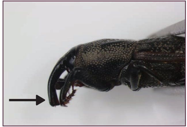
Figure 4. Hunting billbug beak.

begin to feed, mate, and lay eggs. Once they become active in the spring, female adult billbugs begin to lay (oviposit) creamy white oblong shaped eggs that take 3 to 10 days to hatch. Larvae (Fig. 5) of the hunting billbug are white with a brown head capsule. They are legless and are \frac{1}{4} to \frac{3}{8} inch long at the last instar. These larvae feed within the stems of the turfgrass plant, the crown, and the root zone for 3 to 5 weeks before pupating. After remaining in the pupal stage for 3 to 7 days, the adult billbugs emerge and the life cycle begins again until temperatures decrease in the fall.