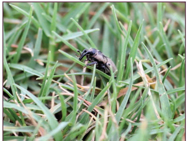
Figure 6. Adult hunting billbug activity on the turfgrass surface.

Scouting for adult hunting billbugs is easier and more effective than scouting for the larval stage, because larvae are often found only in the