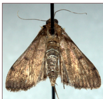
Figure 2. Adult stage of Tropical Sod Webworm

are susceptible to cold and do not survive severe winters. This limits their most severe damage to south Texas where winters are mild. Tropical sod webworms overwinter as larvae, but adults have been documented throughout the year in other southern states, such as Florida. Adult moths spend the day in and around lawns and when disturbed, will make brief flights before coming to rest in other areas. After mating, adult moths lay clusters of eggs on turfgrass blades or other moist surfaces.