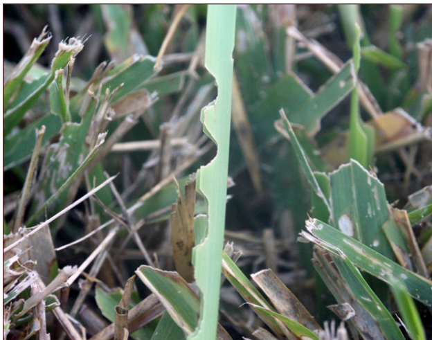
Figure 4. Chewing injury on St. Augustinegrass from Tropical Sod Webworms

shrubs may show the first signs of damage since adults typically rest in these areas and make short flights to nearby turfgrass to lay eggs. It is important to note that multiple generations of this pest can be completed in one year, and that damage can reoccur.