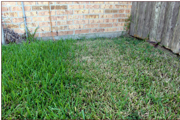
Figure 3. Shortened, chewed turfgrass (right) is an indication of Tropical Sod Webworm damage