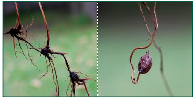
Figure 5. Purple nutsedge tubers (left) often have dense hairs on them and are connected by rhizomes while yellow nutsedge tubers (right) lack hairs (glabrous) and are not connected by chains.

ple or yellow nutsedge. It also grows in bunches, lacks rhizomes, and is more likely to produce a seedhead than yellow or purple nutsedge in turf that is mowed at moderately low heights.