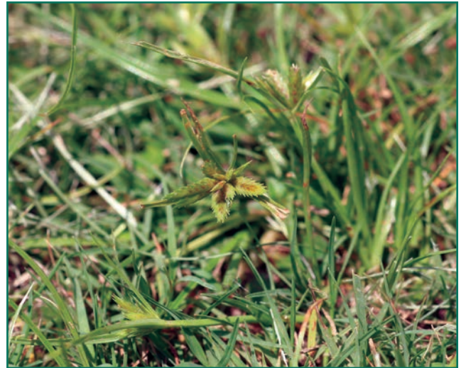
Figure 6. Annual sedge can be identified by its flat seedhead and lack of rhizomes or tubers.

Sedges often indicate chronically excessive soil moisture, which should always be addressed as part of an overall treatment program. Yellow nutsedge is generally easier to control than purple