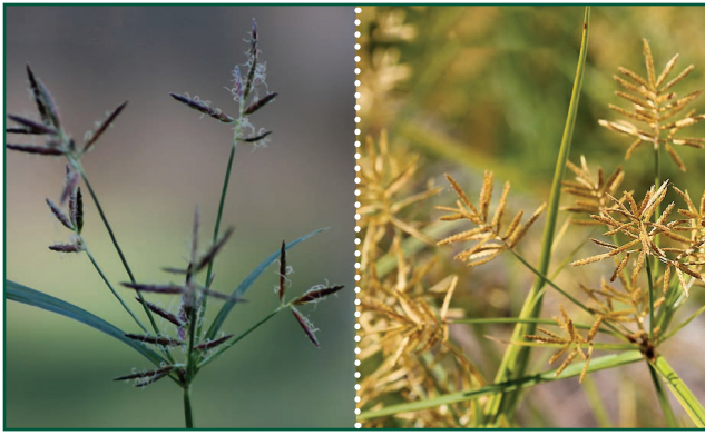
Figure 3. Purple (left) and yellow nutsedge (right) are named for the distinct color of their inflorescence.

Yellow and purple nutsedge are perennial sedges whose names reflect the color of their seedheads (Fig. 3) rarely appear in frequently mowed turfgrass, you can see them easily in adult plants in unmowed areas such as plant beds or ditch banks. In addition to the seedhead color, yellow and purple nutsedge also have distinctly different leaf tips (Fig. 4) and tubers (Fig. 5). Purple nutsedge leaves have a blunt-shaped tip and dark, charcoal-colored tubers connected by rhizomes. Purple nutsedge is also much more likely to have hairs interspersed over the tuber surface. In contrast, yellow nutsedge has leaves that taper to a tip more gradually and rhizomes that have no hairs and are not connected by chains.