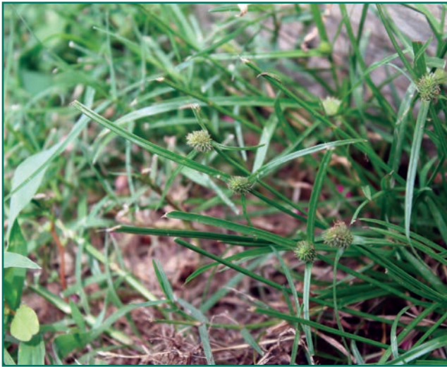
Figure 7. Green kyllinga is a perennial weed with a compact, head-like inflorescence, grows from rhizomes, and tolerates low mowing heights.

nutsedge—kyllinga species are generally the most difficult.