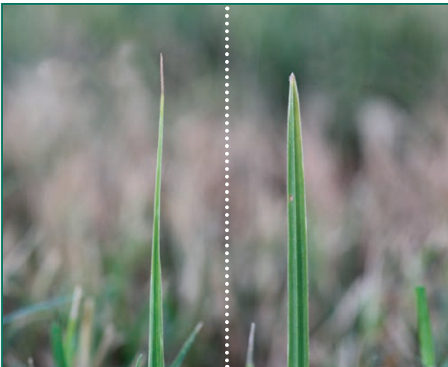
Figure 4. Yellow nutsedge leaf tips (left) gradually taper to a fine point, while purple nutsedge leaf tips (right) end more abruptly in a blunt tip.

Annual sedge (Fig. 6) has spikelets on the seedheads that are much more flattened than pur-